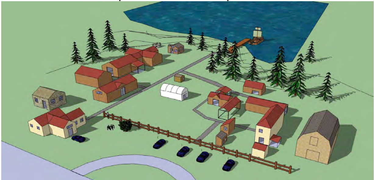
The Lake Champlain Maritime Museum Campus